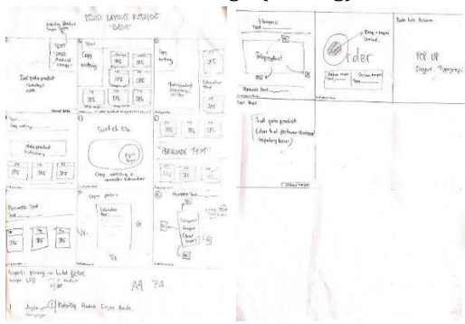
Fig. 11 Catalog Layout Sketch

Is a sketch of the Sayur Bada Promotional Media Design (Catalog):