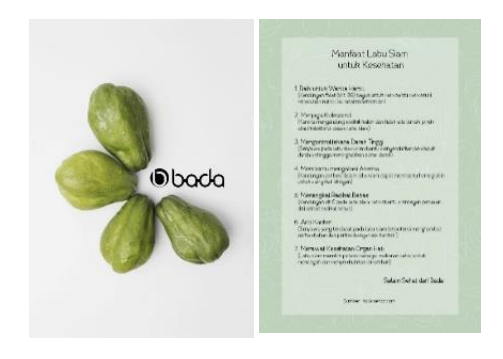
Fig. 19 Notebook 2