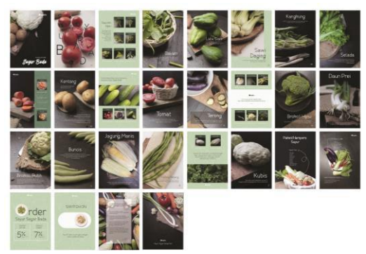
Fig. 11 Product Catalog Design

The catalog in this design consists of 13 pages, including: