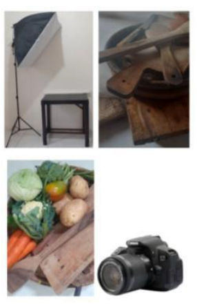
Fig. 6 Equipment