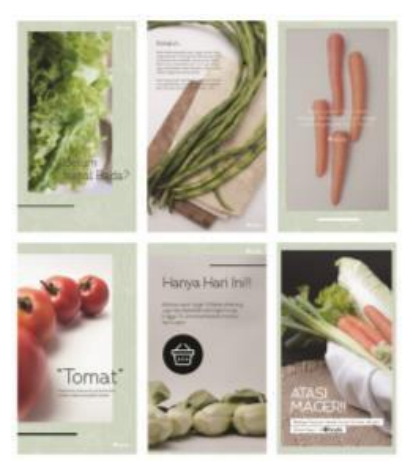
Fig. 13 Instagram Stories

The design of the Instagram feed displays photos of original Bada products by adjusting the characters from the previous Bada Instagram feed. In its implementation, the vegetables used vary widely to give a non-monotonous impression supported by informative text content (products and education) plus an identity in the form of the Bada logo and Bada's social media. Vegetables are applied to the visual feed as a speaker (representing the word availability of similar vegetables in Bada). The dominating colors are pastel colors (green) in accordance with the character color or identity of Bada while at the same time giving a calm impression to any content created. The neutral color (white) also matches the character color or identity of Bada while giving a simple yet attractive impression.arrangements layout aim to give a dynamic impression to the content (saving the meaning of the character from Bada).