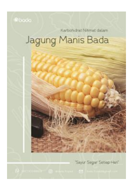
Fig. 16 Poster

In designing the poster design, it will be used as a promotion given to the audience digitally and in print. In the poster design, it displays a photo of an original Bada product along with a simple reminder text. In the layout design, the mustard greens represent the message as the mustard greens here become empathetic, so by implementing the same thing it is hoped that consumers will also feel the impact (positive empathy) from the visuals displayed. The dominating colors are pastel colors (green) in accordance with the color of the character or identity of Bada, even though it gives a calm impression to any content that is created. The shape of the design on the poster seems minimalist with not much use of graphics on each part.