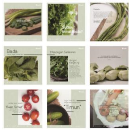
Fig. 12 Instagram feeds

Instagram content in this design consists of 9 Instagram content feeds, and 6 story including: