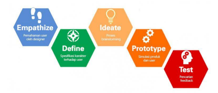
Fig. 1 Stages of Design Thinking