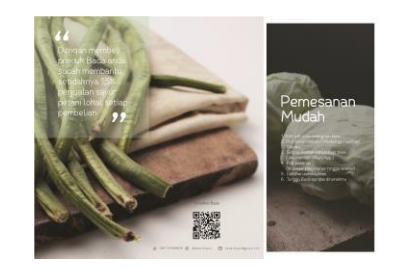
Fig. 15 Brochure side

The brochure design (side 2) displays several photos of original Bada products along with some information on how to order, contact, and Bada's informative text. In the layout design, each vegetable represents the meaning to be conveyed to the audience. Where on the brochure design side 1 is a photo of the long bean vegetable product, which is rich in iron. The aim is to persuade the audience to consume these vegetables, considering that the ingredients are very beneficial for the body, one of which is being able to relieve pain during menstruation. Where this is one of the women's problems (Bada's main target) that is experienced even almost every month. The dominating colors are Bada-aligned colors (green) in accordance with the color of the character or identity of Bada while giving a calm and light impression to any content that is created. The design form on the brochure seems minimalist with not much use of graphics in each part.