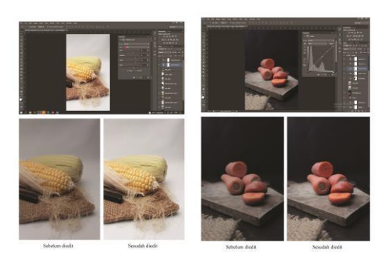
Fig. 10 Editing Process

The embodiment process is carried out according to the ideas, concepts and mood boards that have been made. The mood board that has been designed above is applied to shooting various kinds of vegetables (Cabbage, Carrots, Beans, Celery, Leeks, Potatoes, Tomatoes, Long Beans, Eggplant, Chicory, Chicory, Salted Chicory, Chilli Meat, Spinach, Kale, Cucumber, Broccoli White, Green Broccoli, Salad/Lettuce, Siamese Pumpkin, and Corn) to be realized later. Starting from product and property arrangement, lighting placement, and choosing the background color to be used. Photographic works are shot using the JPG format with an image orientation of 16:9 which can then be adjusted again according to the needs of the layout.