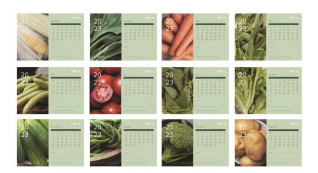
Fig. 21 Calendar Content

The calendar content is the most important part of the calendar itself and implements the original Sayur Bada product photo. The product photos here are arranged in such a way with an angel shot of each vegetable close up. Apart from being emphatic, the types of vegetables whose product photos are implemented on the calendar also have a meaning (story) for each vegetable. Starting from the far left (January), the product photos used are photos of Sweet Corn vegetables, rich in carbohydrates which are the main consumption needs of Indonesian people so the product photos are placed at the beginning (January). Followed by February, namely green mustard greens, carrots (March), kale (April), beans (May), tomatoes (June), spinach (July), salad (August), cucumber (September), long beans (October), broccoli (November) which are additional nutrients and vitamins that are very useful for the body to be consumed as a companion to carbohydrates. Finally, in December, it was closed with a photo of a potato product (a source of carbohydrates as well) aimed at remindingthe audience that consuming vegetables must be balanced and measured accordingly to feel the maximum benefits.