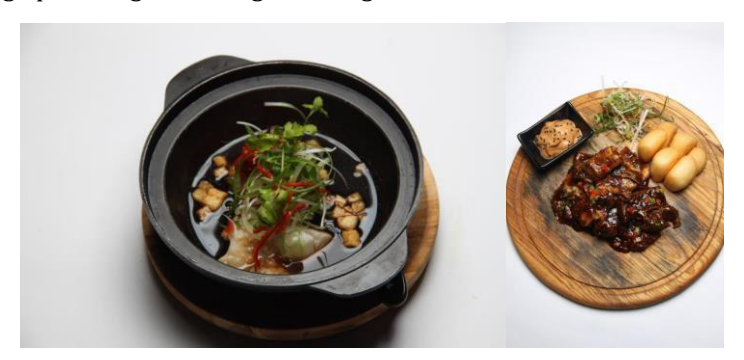
Fig. 3 Previous Research 3

The final visuals produced were quite good and persuasive, but in some works they felt too dense because properties when taking product photos, making it audience to focus on the main product. The final work reference is a thesis entitled Design of Promotional Media for The Journey Kitchen – In East Surabaya Using Photography Techniques by (Nugraha, 2017). The study in this research is more on the design of the photography. The design process goes through the stages of data collection with observation techniques.