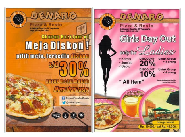
Fig. 2 Previous Research 1

The design process goes through the stages of data collection using observation techniques, interviews, documentation, and analyzed using the SWOT technique (Strengths, Weaknesses, Opportunities, and Threats). rough idea layout, complete layout, layout, stages of making promotional media in the process of making the final design.