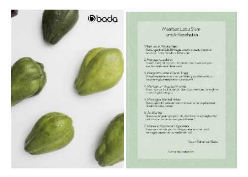
Fig. 18 Notebook 1