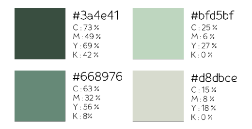
Fig. 4 Design Colors

From these colors, each color has its own theoretical meaning. The darkest shade of green (#3a4e41) is a dense undertone, representing dignity, assertiveness and strength, as well as wealth and abundance. A lighter green (668976) indicates growth, vitality and renewal. The brightest green (#bfd5bf) conveys youth, passion, creativity, and innovation. The last color, which is light gray (#d8dbce), gives a calm and comfortable impression. In general, the green color itself is synonymous with the color of leaves and nature (Bada products), which are natural and soothing. So that from the application of the several colors above in the implementation of Sayur Bada's promotional media design, it is hoped that it will have a positive impact according to the meaning in the application of colors.