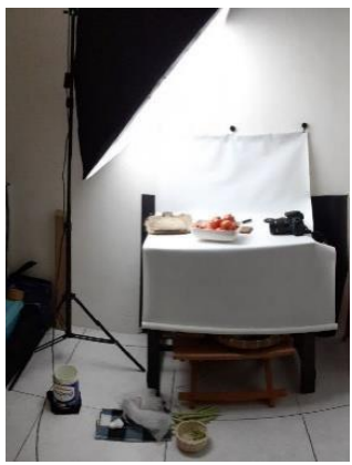
Fig. 7 Shooting Implementation Shooting

Was carried out in late March to early April, using 20 kinds of vegetables (Cabbage, Carrots, Beans, Celdri, Prei Leaves, Potatoes, Tomatoes, Long Beans, Eggplant, Chicory, Salted Chilli, Chilli Meat, Spinach, Kale, Cucumber, White Broccoli, Green Broccoli, Salad/Lettuce, Siamese Pumpkin, and Corn). Shooting will be carried out from morning to noon then will take a lunch break and then continue until the afternoon. In a day there are approximately 3-4 vegetables that can be photographed, bearing in mind that in practice there are constraints on battery strength which can only last a few hours and then charge for a while and then start again. Charging time is also used to rest and restore concentration as well as maintaining body condition and mood to stay primed. Approximately 15 to 20 frames of photos will be taken from each clothing theme (each vegetable and different background). This is done to prevent when there are several blurry images so that you have a lot of stock photos.