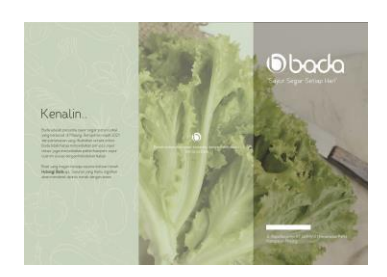
Fig. 14 Brochure side 1

In designing the brochure design (side 1) it will be used as a promotion given to the audience or customers through gifts or souvenirs. As well as in strengthening the company's relationship with clients in the coming year, Bada will provide a new year's calendar and insert the brochure. Three quarters of the brochure design is filled with original Bada product photos along with some information regarding Bada's address and tagline, as well as text describing what Bada is. The photo used is a vegetable salad used in two parts of the brochure folds to give a unified impression on the visual appearance. Where in the brochure design side 1 the photo of the lettuce vegetable product represents vegetables which are usually used as fresh vegetables (consumed raw) to give freshness to every bite of food which is usually seasoned with chili sauce. The dominating colors are pastel colors (green) in accordance with the color of the character or identity of Bada, even though it gives a calm and light impression on any content that is created. The design form on the brochure seems minimalist with not much use of graphics in each part.