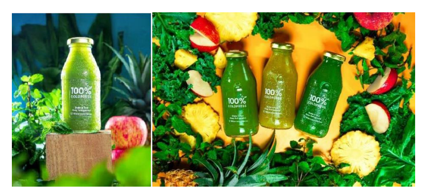
Fig.3 Previous Research 2

The final visuals produced were quite good and persuasive, but in some works they felt too dense because properties when taking product photos, making it audience to focus on the main product. The final work reference is a thesis entitled Design of Promotional Media for The Journey Kitchen – In East Surabaya Using Photography Techniques by (Nugraha, 2017). The study in this research is more on the design of the photography. The design process goes through the stages of data collection with observation techniques.